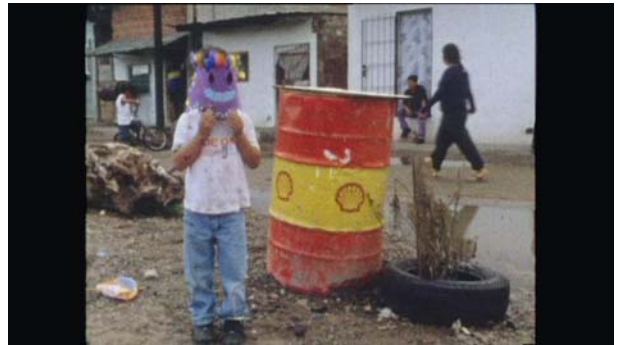
shell gas station