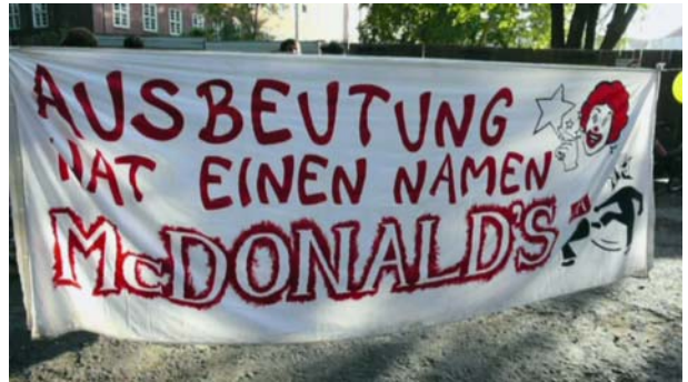
mcdonalds 'fast food