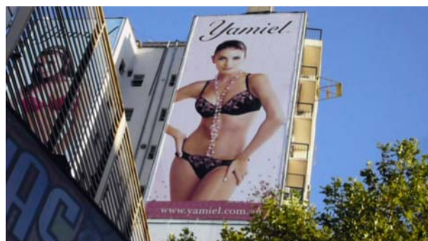
caras magazine web release: 17th of February 2009