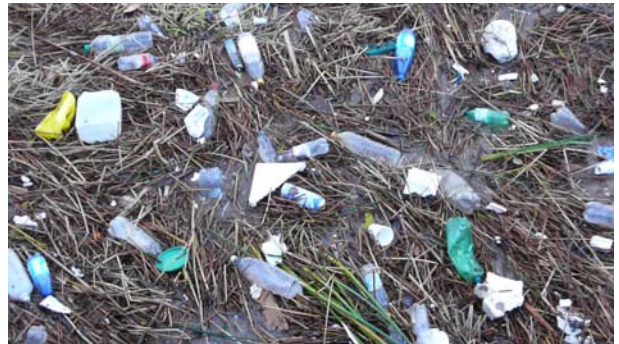
volvic table water