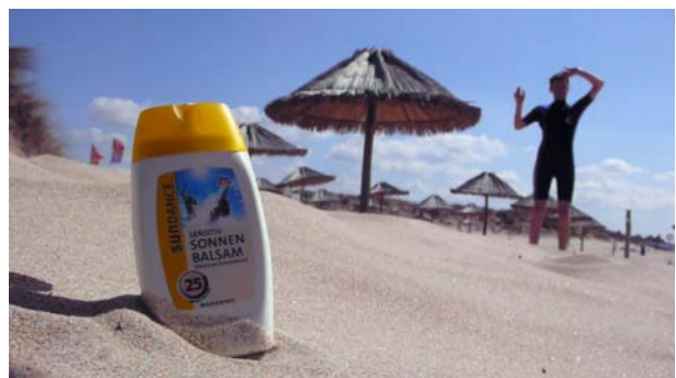
sundance sun lotion

Translation Ramsey Arnaoot and Benjamin Letzler