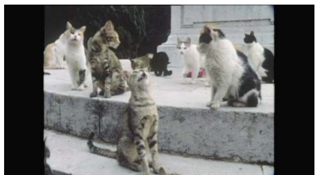
whiskas cat food