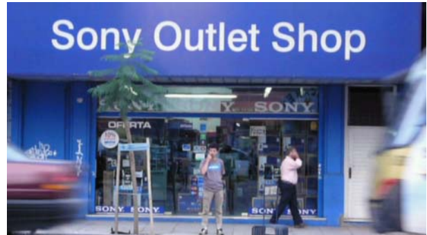
sony entertainment electronics