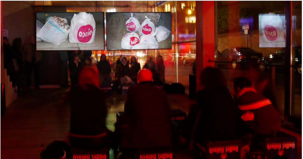
installation "unauthorized commercials" "raum fuer projektion" kyoto bar, cologne